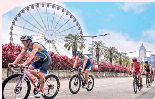
The triathlon event will be staged in Hong Kong. The test event was successfully held at the Central Harbourfront and Victoria Harbour earlier.

Government of the Hong Kong Special Administrative Region will continue to foster sports development by maintaining Hong Kong as a centre for major international sports events and developing sports as an industry.